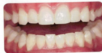
After Opalescence Go whitening trays