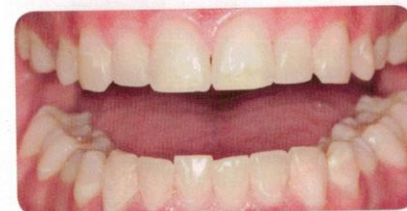
Before Opalescence Go whitening trays