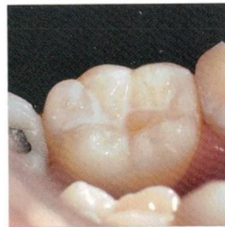
After sealant placement