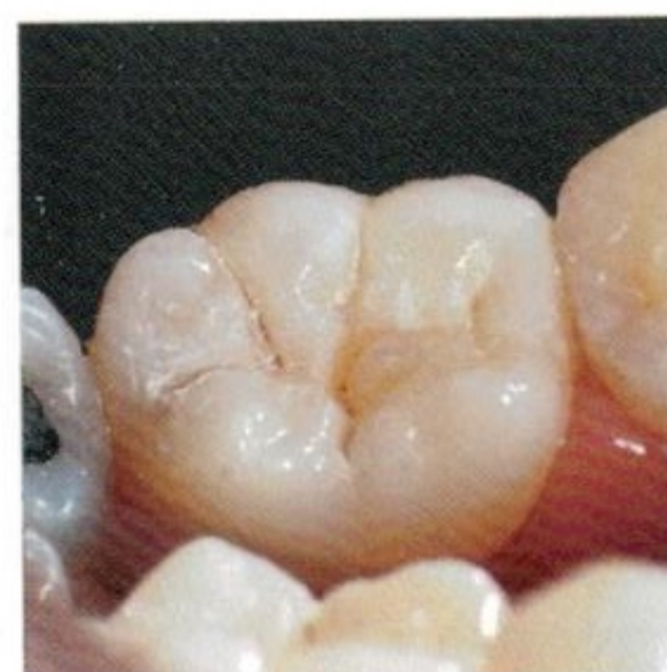
Before sealant placement

By creating a barrier against plaque and food, sealants are an extremely effective way to protect your child from tooth decay. In fact, sealants have been shown to reduce cavities by 70% compared to unsealed teeth! 1